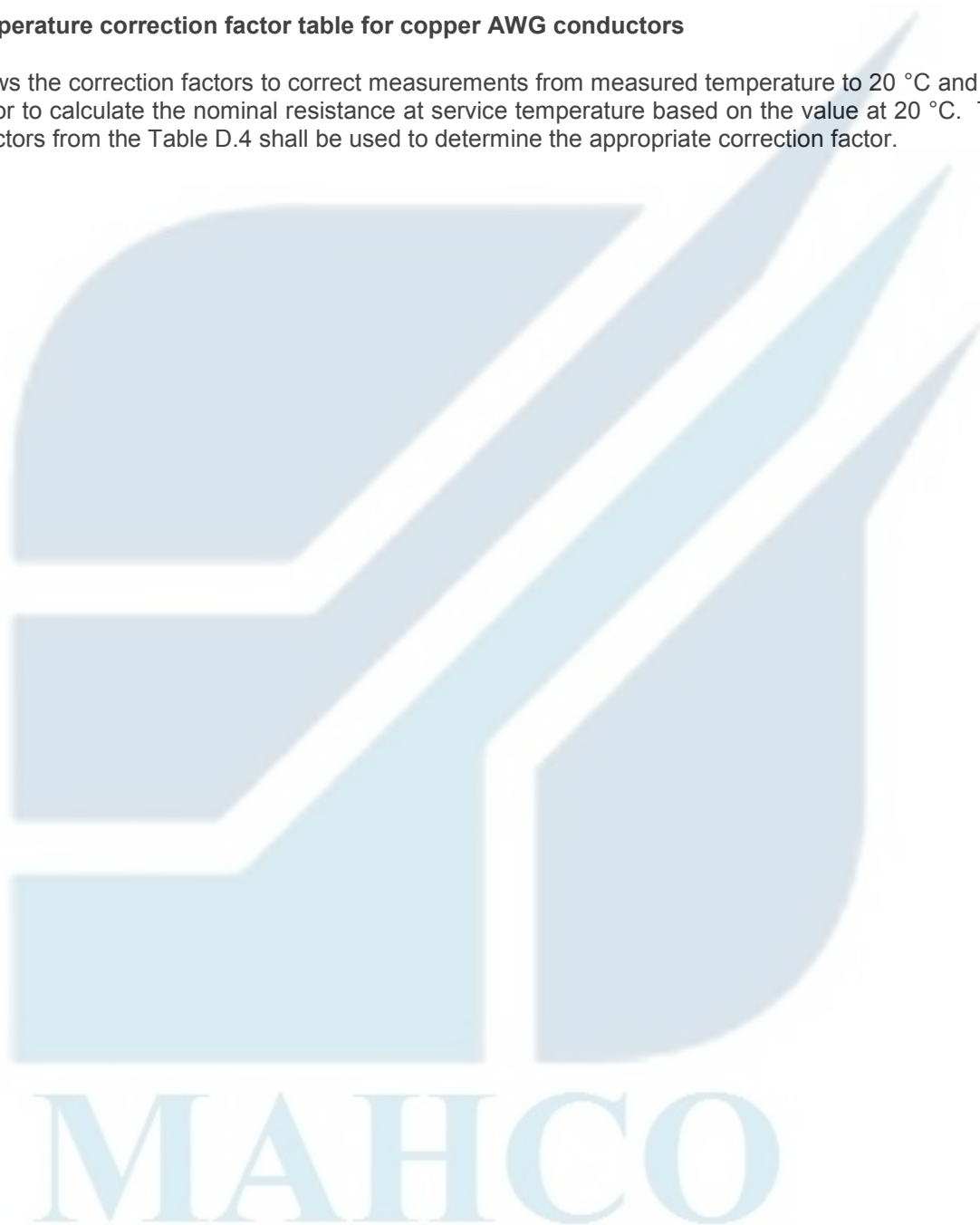
Table D.7 shows the correction factors to correct measurements from measured temperature to 20 °C and the correction factor to calculate the nominal resistance at service temperature based on the value at 20 °C. The conductivity factors from the Table D.4 shall be used to determine the appropriate correction factor.